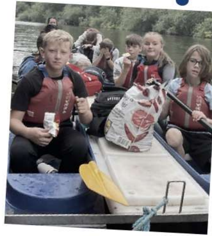
Year 6 Bell-boating Regatta