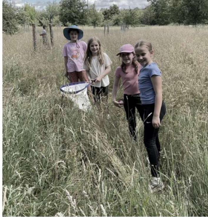
Year 4 enjoy a day at Smite farm

Trips have remained an integral part of the Northwick learning experience, enriching the curriculum and providing valuable opportunities for independence, confidence, and teamwork. Children have enjoyed visiting a range of exciting destinations that have enhanced classroom learning. These include: West Midlands Safari Park, Bishops Wood, The Hive, The Commandery, St Stephen's Church, Worcester Mosque, The Black Country Living Museum and Smite Farm to name but a few.