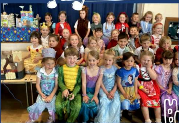
Reception - Fairytale Showcase