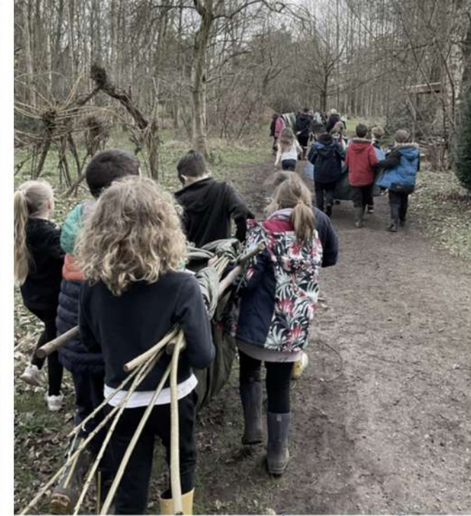
Year 3 at Bishops Wood