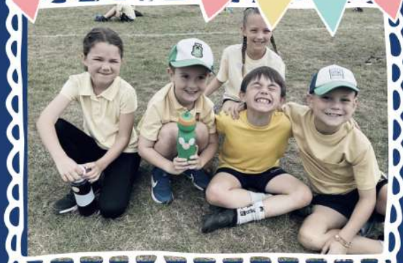
Sports Day June 2025