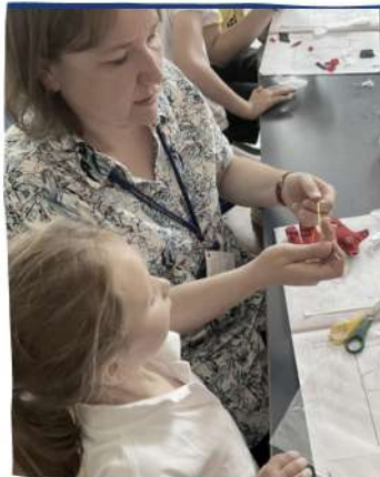
Year 2 DT Workshop