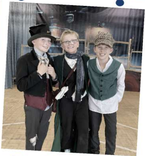
Year 6 Production of Twist