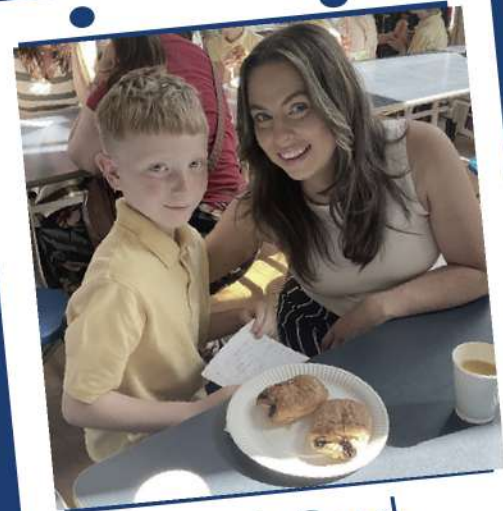
Year 4 French Breakfast