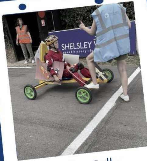
Box Car Rally