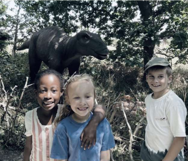
Year 2 enjoy a day at All Things Wild