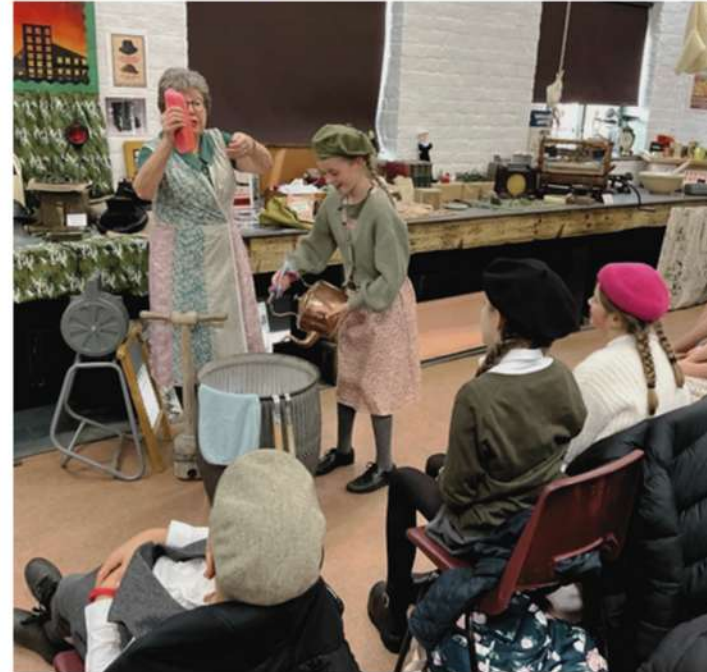
Year 6 dressed up as evacuees for their trip to Bewdley Museum.