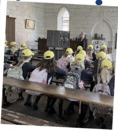
Year 5 trip to Black County Museum