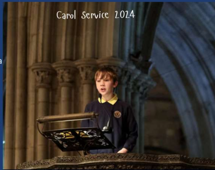
Carol Service 2024

Music is a very important part of each child's experience at Northwick and we aim to foster a love and enjoyment of music and performing. Throughout the year children have practiced their performance skills just as much as their instruments and voices. Platforms range from assemblies to concerts and special events like the Carol Service.