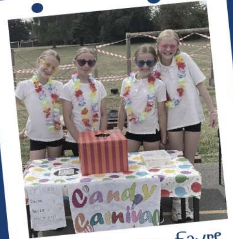
Year 6 Summer Fayre fund raiser