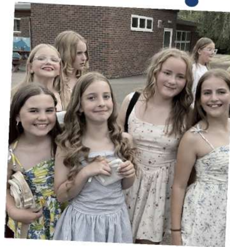
Year 6 leavers' disco