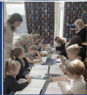
Year 1 art workshop