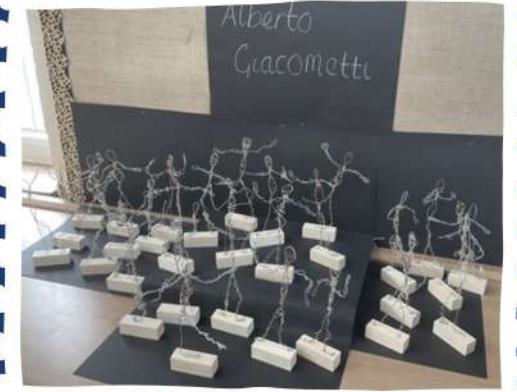
Year 3 Sculpture Workshop