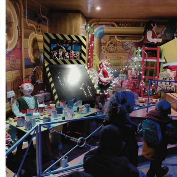
EYFS meet Father Christmas at West Midlands Safari Park